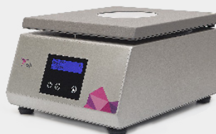
· System V centrifuge.