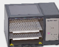
· Plasmaterm® H oven.